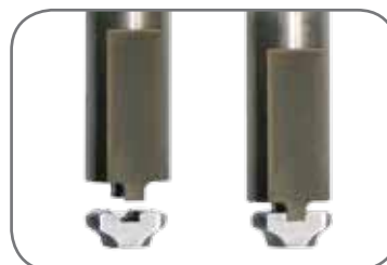
Exclusive to Flexco